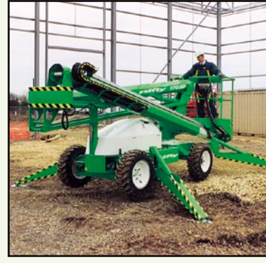
Also available on a self-drivable 2x4 or 4x4 base, the Nifty 170SD .